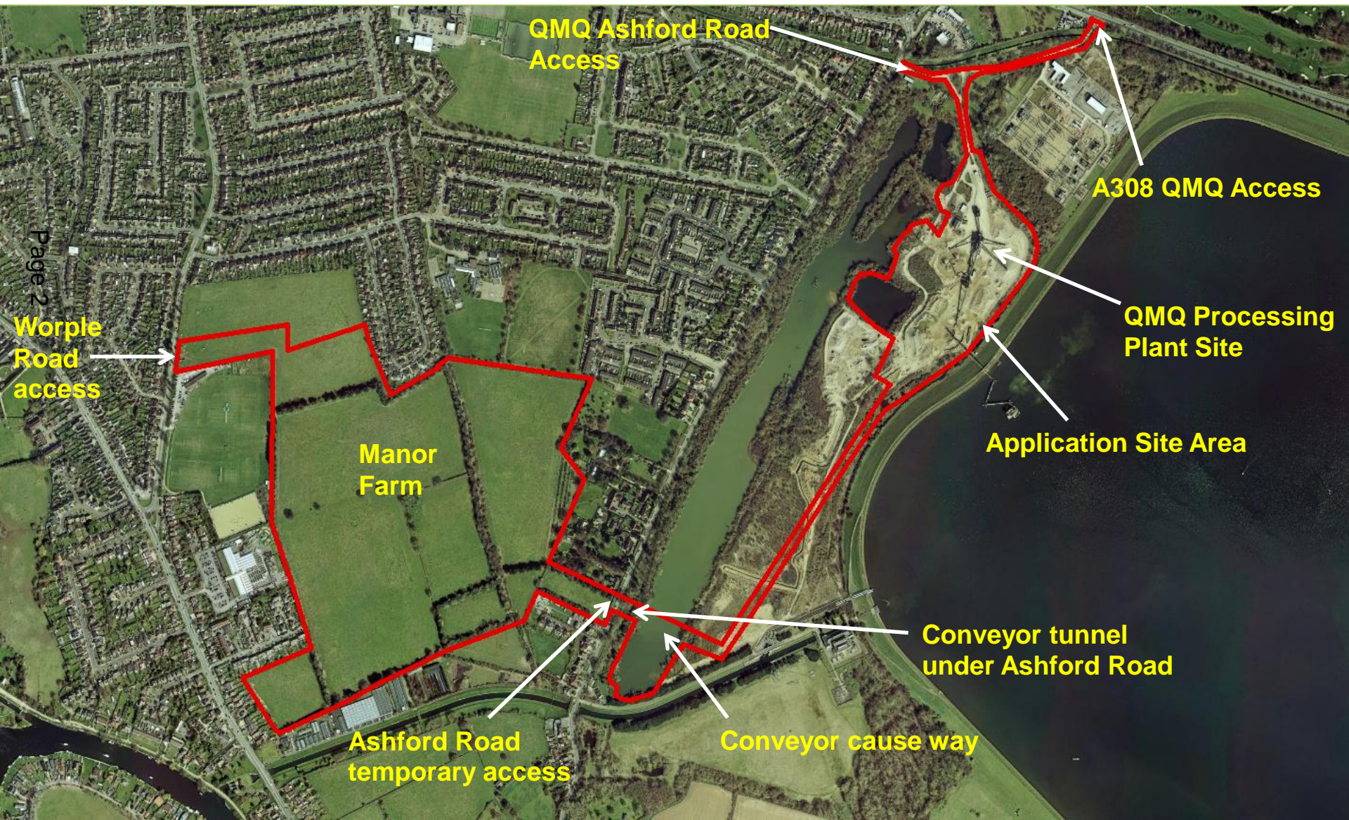
Aerial 2 : Manor Farm and Queen Mary Quarry (QMQ)